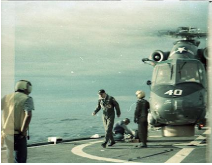
Visit by the Secretary of the Navy, J. William Middendorf, 11 Dec 75.