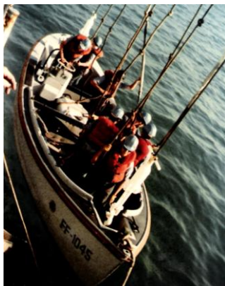
Motor whale boat