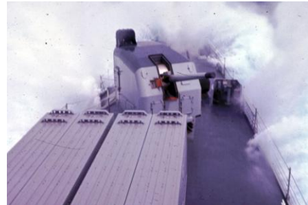
Heavy seas in 1967