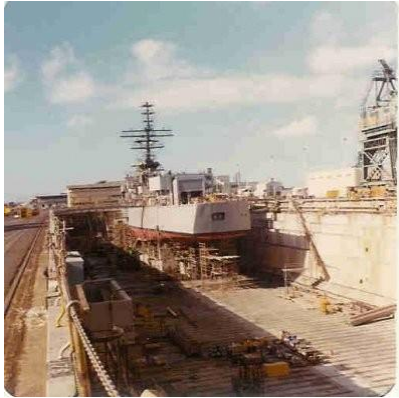
In dry dock