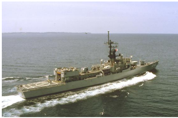
1982 at sea transiting Philippine Islands from Tacloban port visit.