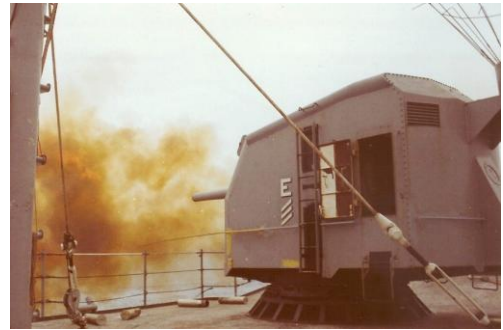
Mount 51 firing