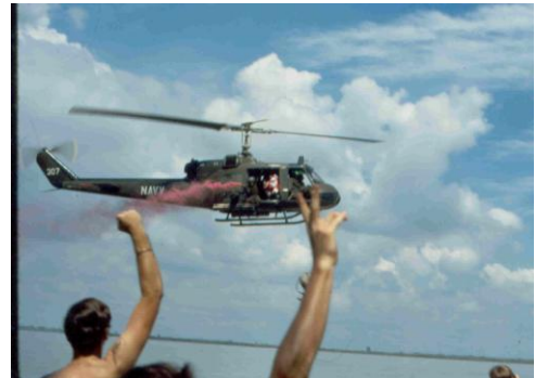
Santa in chopper